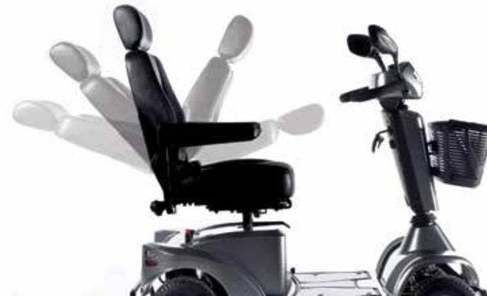
→ Quick backrest angle adjustment