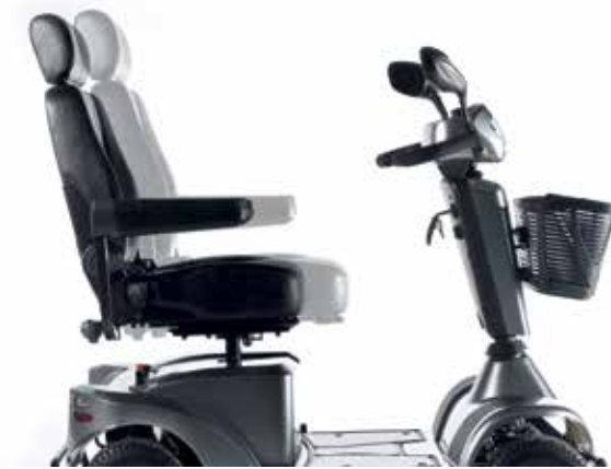
→ Infinite seat depth adjustment

The S700 advanced seating solution takes comfort to the highest level. From the seat height, seat depth and back recline adjustments, to the flip-up armrests including width, angle and depth adjustments – every feature has been designed for comfort – for you.