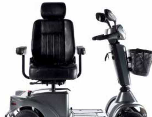
→ Seat rotation enables comfortable transfers