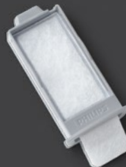
Reusable pollen filter