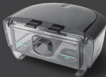
Water tank with lid