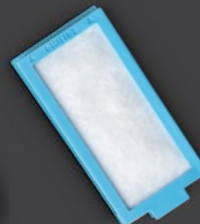
Ultrafine pollen filter